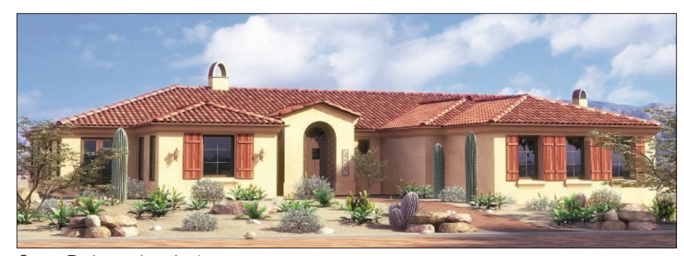
Santa Barbara elevation*