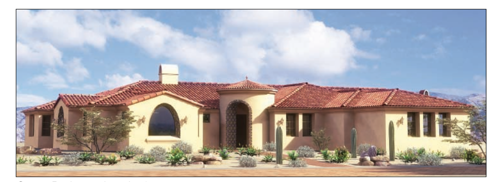
Santa Barbara elevation*